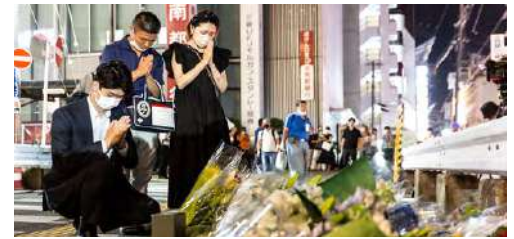
parliament are typically seen as a referendum on the current government. But a big victory for the LDP would strengthen the current prime minister's ability to push through his key policies, including a doubling of defence spending. Abe was Japan's longest-serving prime minister and died aged 67. He was campaigning for the LDP in the run-up to upper house parliamentary elections on Sunday.

Elections for Japan's less-powerful upper house of