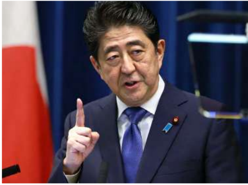
Japan's ex PM Shinzo Abe was shot dead while giving a speech at a political campaign event on July 8, to the shock and horror of the world.