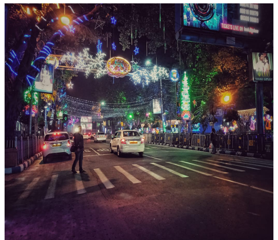
Christmass carnival at Park Street