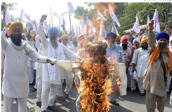
Farmers burning a dummy of PM Modi on the outskirts of Amritsar

nership fixing low prices for the farmers' produce, forcing distress sales.