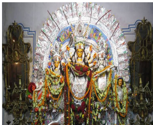
The inside look of a 248 years old, Shabeki Durga Puja. A prevalent celebration extending years of culture and tradition.

The city's oldest Durga Puja in their Barisha address, started in the year 1610 and is older than the city itself. Right now, eight separate Durga Pujas are hosted by the different branches of the family, namely, Aatchala, Boro Baari, Mejo Bari, Majher Bari, Benaki Bari, Kalikingkar Bari, Nimta and Birati. However, the archaic Atchala Durga Puja is still now performed at its original site.