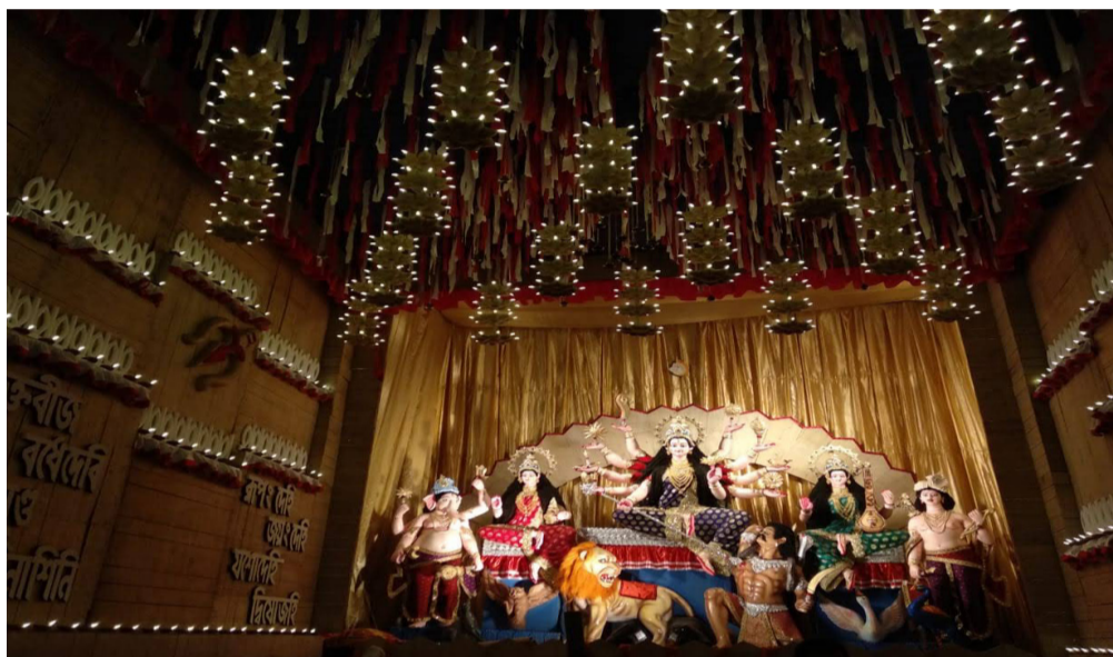
Azadi golli, Cheragi pahar

With many themed pujo and different versions of Maa Durga's idols throughout the city, most people still want 'Satwik Pujo' to be normalized. That's why Azadi golli Puja Committee were widely appreciated last year. With beautiful decorations and a wholesome idol of Maa Durga they are bringing a change in the air. One of their members said, "We wanted to show that even without high budget, a beautiful puja