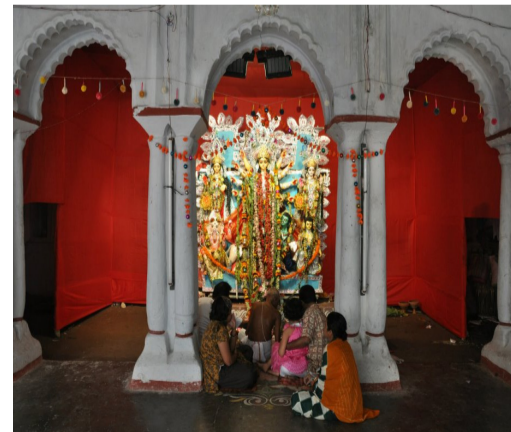
The prevalence of Pujo celebration that go years behind the history of the city alone.

Brahmin cooks arriving from the district of Medinipur. Some of the items on the menu are pantua, mithey goja, chauko goja, peraki stuffed with cinnamon flavoured kheer, katkati, shingara, nimki, and radha ballavi. A unique item is the motichoor, a mammoth laddu which, unlike regular motichoor, is pristine white in colour. They carry out the rituals and ensure that an extravagant bhog is offered to Maa Durga with more than 50 dishes, an extraordinary one being 'Mete Chocchori', offered on Navami. The Choto Rajbari also serves a splendid lunch of pulao, luchi, alur dum and sweetmeat. But this year, some changes are taking place due to the