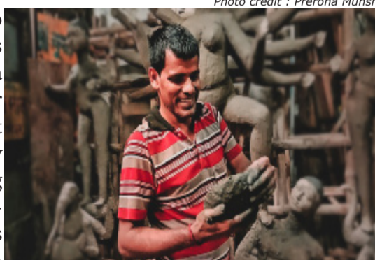
Covid vs. Pujo - A take on battling a pandemic whilst the biggest celebration.