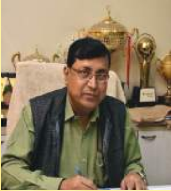
PROF. (DR.) NIRMAL KANTI CHAKRABARTI Vice Chancellor, The W. B. National University of Juridical Sciences

It is a long established truism that, practice makes perfect. And perhaps nowhere is it more abundantly in evidence than in the Practice of Moot Court. Participation in Moot court is arguably unique in that it is one where the academic, intellectual, emotive and performative aspects are called upon with equal rigour – something which not only tests the mettle of its practitioners, but also the very skills that ensure the true actualisation of an adversarial system of justice dispensation.